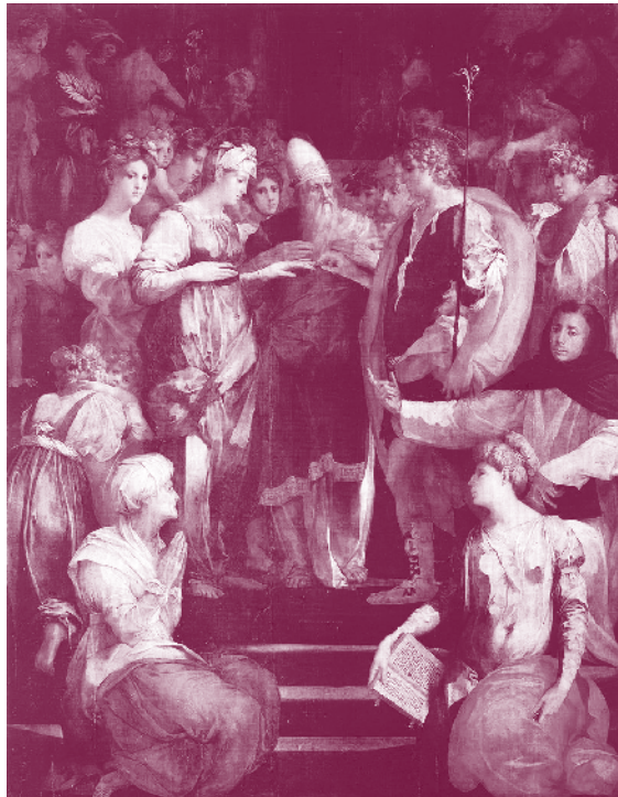
Marriage of the Virgin (1523) Rosso Fiorentino